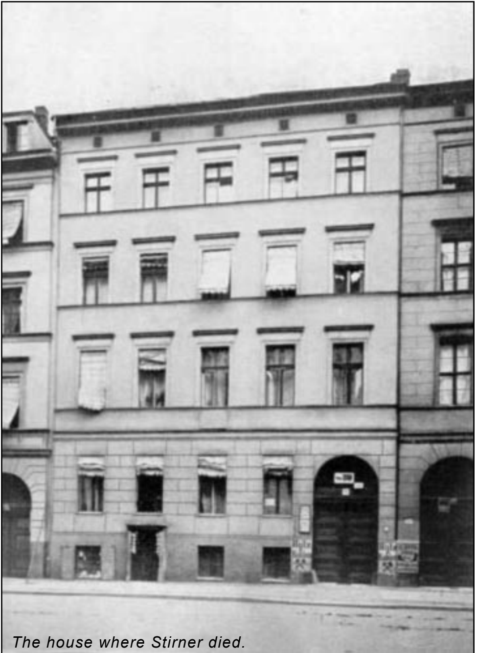
The house where Stirner died.