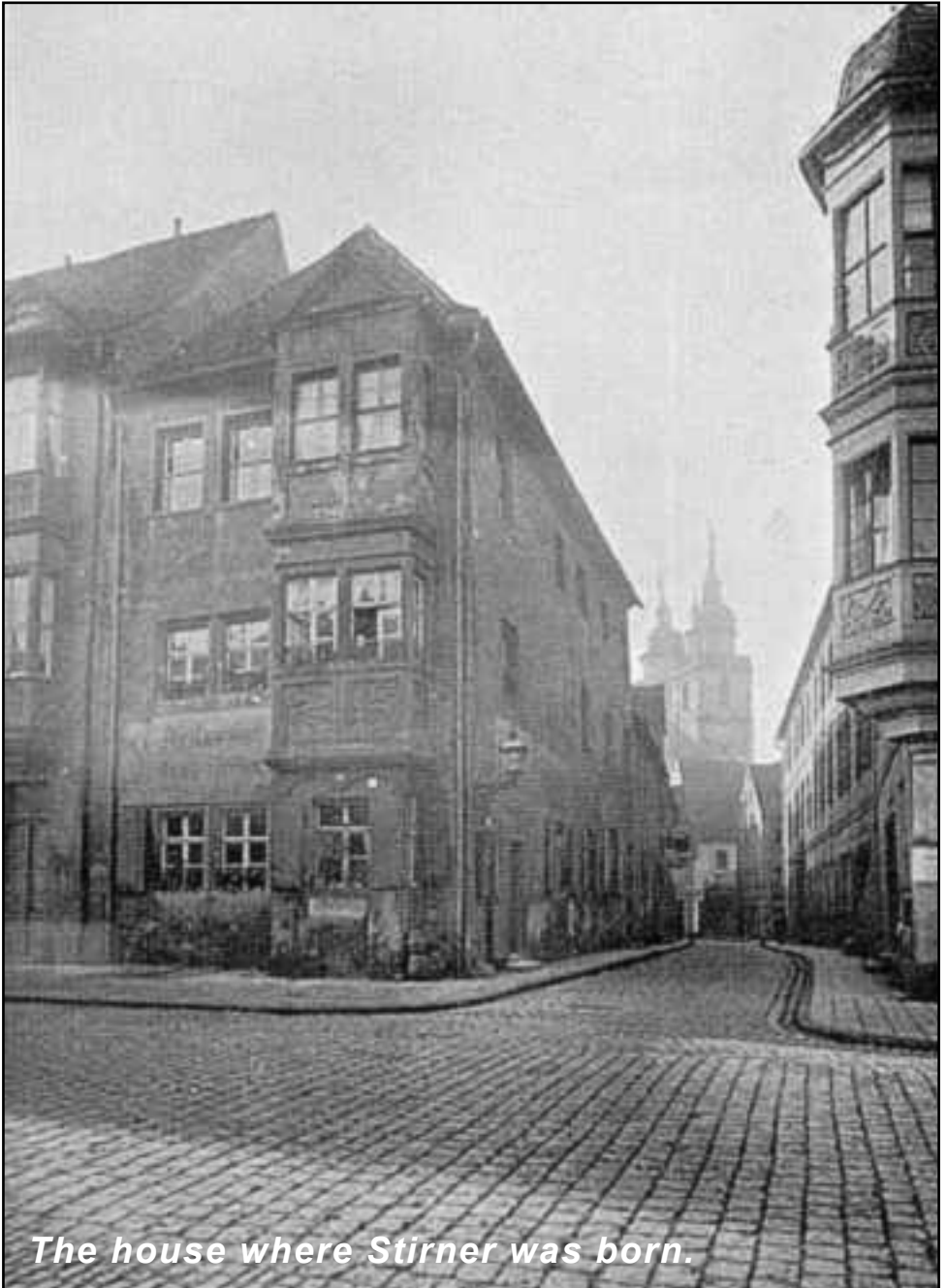
The house where Stirner was born.